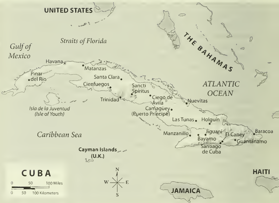
MAP 1 • Map of Cuba with major cities and contemporary political boundaries.